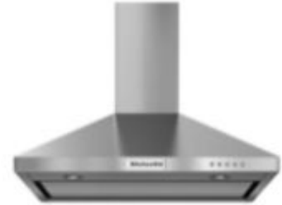
KVWB400DSS 30" Wall-Mount, 3-Speed Canopy Hood