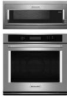
KMBT5011KSS 1000 Watt Built-In Low Profile Microwave with Slim Trim Kit KOSE500ESS 30" Single Wall Oven with Even-Heat™ True Convection

ProWash™ Cycle PrintShield™ Finish Adjustable Middle Rack Heat Dry Option Extended Heat Dry Option Durable Stainless Steel Interior